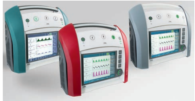
Fritz Stephan's line of EVE medical ventilators.

The three models – EVE TR for emergency response, EVE IN for inpatient treatment, and EVE NEO for use in neonatal units – are equipped with the latest in ventilation-turbine and